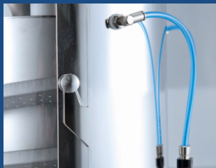
Dust agitation system