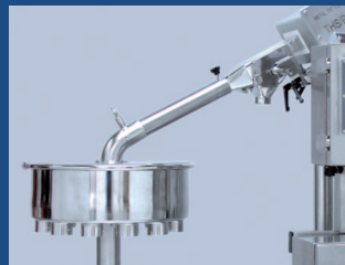
Option: Product Diverter V4000