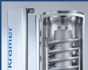
Pivoting and fully removable Window